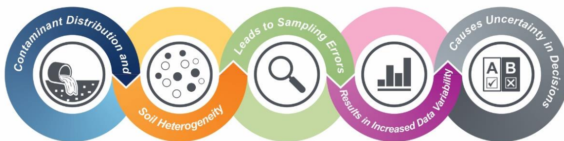
Figure 1. Factors that Impact Data Variability and Uncertainty in Discrete Soil Sampling

Field sampling and subsampling account for a major source of error due to the high degree of variability when sampling soil for chemical contamination (Walsh et al., 2019). As shown in Figure 1, the potential for sampling errors from discrete sampling can result from factors such as varying contaminant distribution and soil heterogeneity across a given site. The sampling error can be increased if the sampling approach does not properly account for significant spatial variation in the contaminant distribution and/or the impact that soil properties can have on contaminant fate and transport (United States Environmental Protection Agency [USEPA], 2019). This increased data variability can ultimately lead to a higher level of uncertainty in remedial decisions for the site. The ISM protocol was designed to overcome these issues by collecting many increments (typically 30 to 100) from all parts of a DU, processing the increments by drying, sieving, and grinding (if compatible), thoroughly subsampling, and using larger aliquots of soil for analysis.